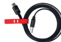
USB-A / USB-C CABLE