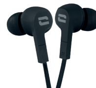
IPX6 WATERPROOF HEADPHONES